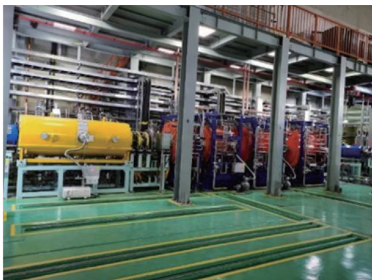
Fig. 1 (color online) Upgrade of SSC Linac.

In 2022, the upgrade of the SSC Linac was carried out successfully. Other two DTL cavities, namely DTL3&4, were installed on the beam line, as shown in Fig. 1. After this upgrade, the energy of linac will be increased to 1.48 MeV/u. Then the heavy ions like \text{U}^{46+} with a final energy of 15.53 MeV/u can be delivered by the SSC.