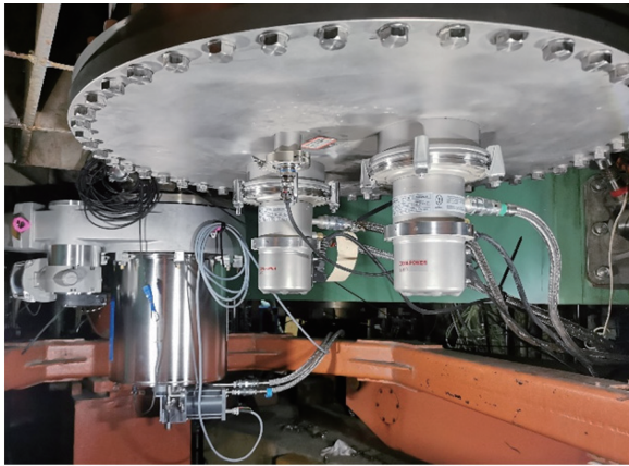
Fig. 1 (color online) SSC vacuum system cryopump installation.

(2) By reducing the gas loading to increase the vacuum of SSC, the main method is to carry out comprehensive vacuum leak detection of SSC cavity and cleaning of the cavity.