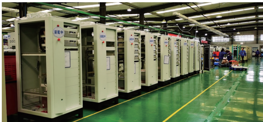
Fig. 2 (color online) The picture of the DC power supply after assembly.