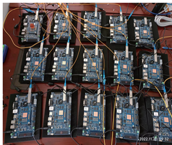
Fig. 2 (color online) Electronic cooling control hardware.

We completed the software and hardware development of electronic cooling and electronic internal target control prototype. Figure 2 is the Electronic cooling control hardware. The installation of the first ion source SECR2 control system cabinet (2 units) at the front end of HIAF has been completed. HIAF Chopper and Kicker control system hardware has been completed. At presently, we are conducting joint testing work with subsystems. The HIAF control network is designed based on three-level (core, aggregation, access) network architecture, and achieves 40 Gbps backbone network. The access switch adopts the mode of 10 Gigabit uplink and Gigabit downlink to ensure high data throughput. We designed a configuration administration system to manage the configuration and running status of the HIAF Timing System.