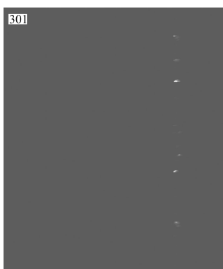
Fig. 2 Pixel image of water droplets with 45 ° between laser and camera.