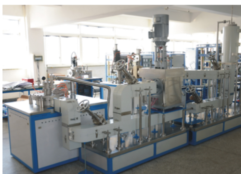
Fig. 1 (color online) Experimental setup for the study of ion-irradiation/LBE-corrosion synergetic effects.

More, two experimental setups are under construction in which one setup will be linked to 320 kV platform for tens keV to 10 MeV ion implantation/irradiation a temperature ranging from room temperature till to 1 000 °C, another setup will be installed to the HIRFL-SFC for investigating the irradiation induced creep behavior in materials under several to hundreds MeV ion irradiation at high temperature up to 1 200 °C.