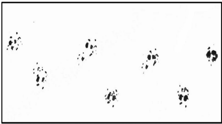
Fig. 1 Footprint pattern.

In this study the head of Blab/c mouse, mesencephalon specifically, was exposed to carbon ions of 5 Gy. To avoid affect the peripheral nerve of mouse head, a special collimator was developed. In order to explore the short-latency effect of exposure to high energy particle radiation (HZE) on motor coordination and stamina, Gait and rotarod tests were employed. Twelve female Blab/c mice and twelve genetically matched wild-type (WT) mice were used in this study. Gait test provides a powerful measure of the precision and coordination of walking by the degree to which the forepaw and hind paw prints overlap. The mouse's paws were dipped in ink (forepaw red and hind paw black) so that the walking gait can be recorded as a track of footprints on the paper. Rotarod provides a simple automated test of an animal's ability for motor coordination and balance on a rotating rob, where the speed of rotation was 20 r/m. Fig. 1 shows that Footprint pattern of a mouse one week after irradiation with carbon ions (30 keV/(m, 5 Gy).